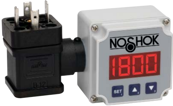
Unit with relay option shown.