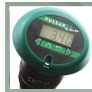
Imp+ 3 & 6